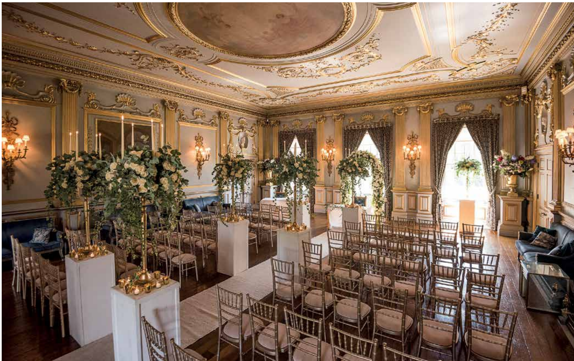
Chairs courtesy of Childwall Table & Chair Hire. Room decoration by external supplier

Knowsley Hall is, without doubt, an idyllic place to take your vows. Your photographs will be testament to a joyous day that is truly magical. And, of course, you will be adding your own unique experience to the estate's remarkable history.